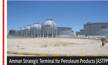
Amman Strategic Terminal for Petroleum Products (ASTPP)