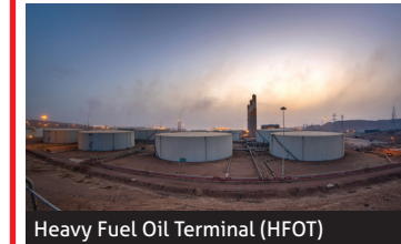
Heavy Fuel Oil Terminal (HFOT)